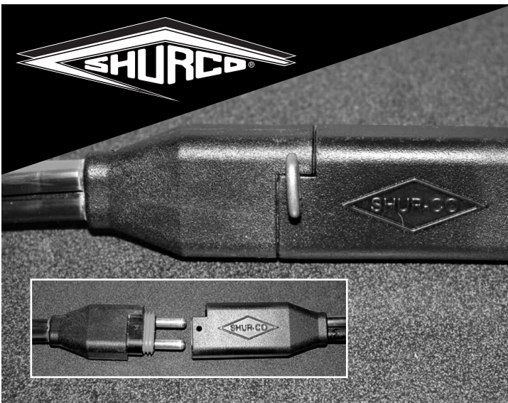
Above: SMARTwire™ sealed harness for plug-and-play installation. Inset: SMARTwire™ unplugged.

For additional information about Shur-Co® products, give us a call at 1.800.474.8756 Monday through Friday, from 8:00 a.m. to 5:00 p.m. Central Time. Our friendly and knowledgeable Customer Service Representatives will be happy to answer your questions. Or log on to our website at www.shurco.com .